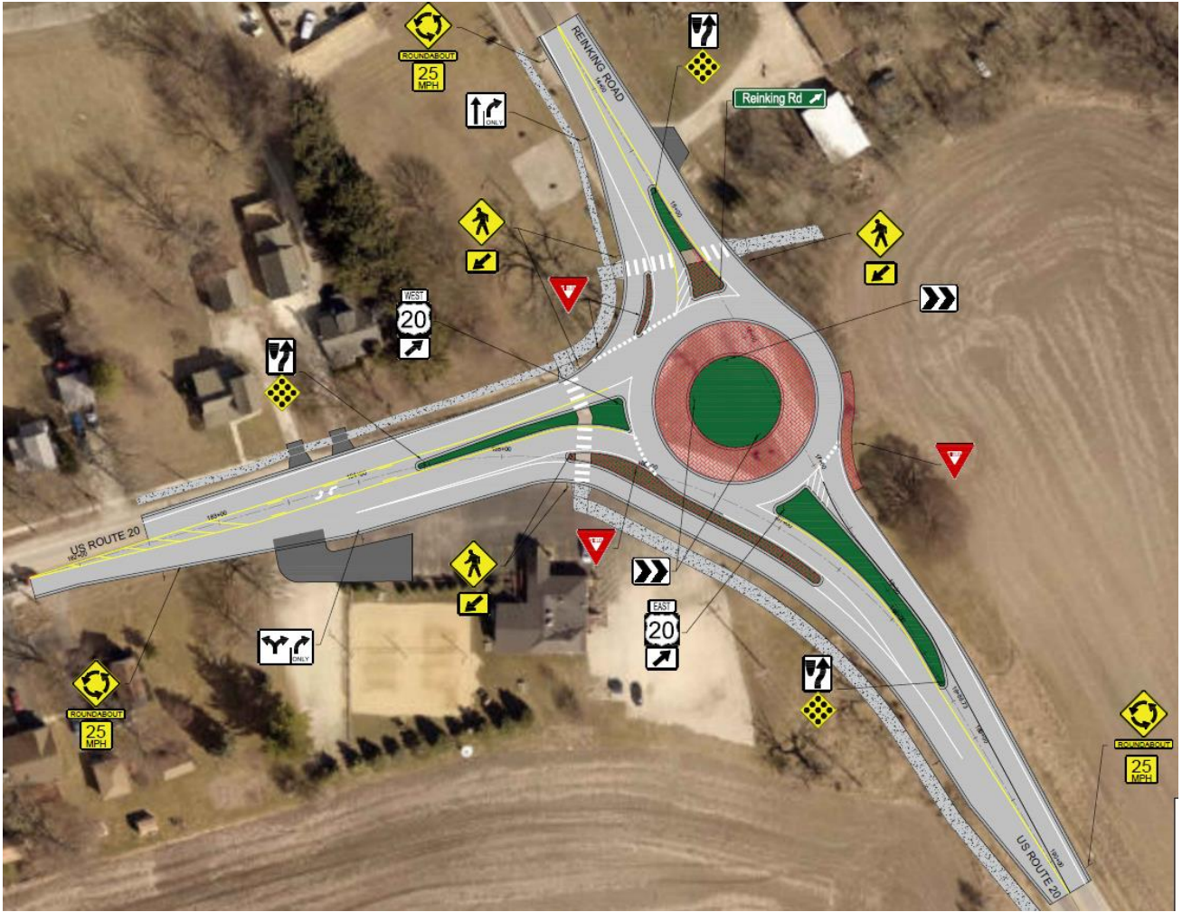
US 20 Roundabout Project Layout